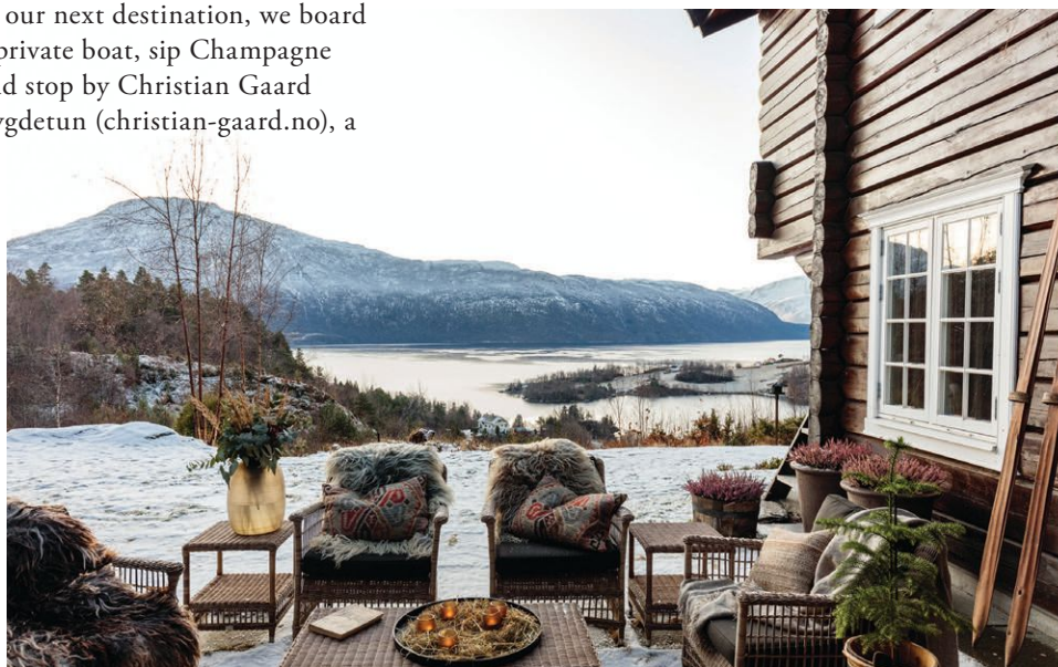
Clockwise from top left: Sommerro House’s 246 rooms pair Norwegian functionalism with art deco details; explore Norway’s bounty at Restaurant Skadir at Skåbu Fjellhotell; snap a photo at the famous swing at Christian Gaard Bygdetun; views of the Sunnmøre Alps abound at Storfjord Hotel; Ekspedisjonshallen restaurant at Sommerro.

One of the country’s most breathtaking sights lies between Norway’s majestic mountains—fjords. These deep, narrow bodies of water reflect the snowcapped peaks above with a glasslike quality that inspires awe. To get to our next destination, we board a private boat, sip Champagne and stop by Christian Gaard Bygdetun ( christian-gaard.no ), a