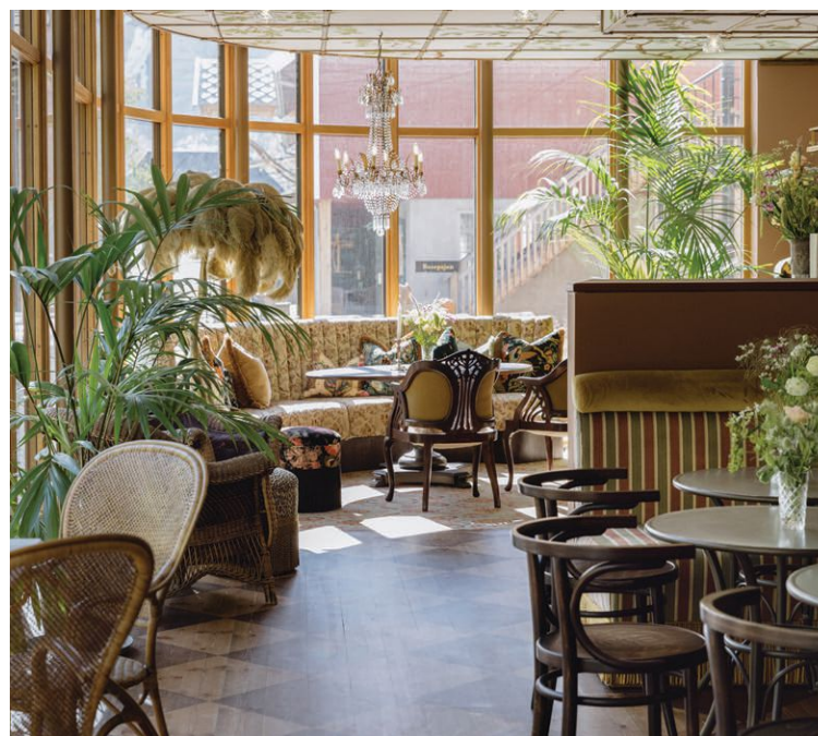
Clockwise from top: Happy hour awaits at The Palm Room at Hotel Union Øye; upscale dining takes place at the hotel's Conservatory; Hotel Union Øye's Swiss-inspired architecture charms.